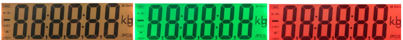
Adjustable Tri-Color Check Result Backlight